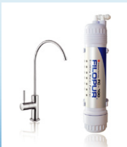
WATER FILTER, UNDER SINK MASTERLINE FC-100