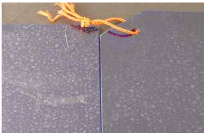
Left tile in use without shower filter, Right tile in use with shower filter

The pictures clearly show a significant difference of the scale deposits on the plastic boards. The Filopur shower filter changes the lime into a more water soluble type called "Aragonite" so it is washed away more easily.